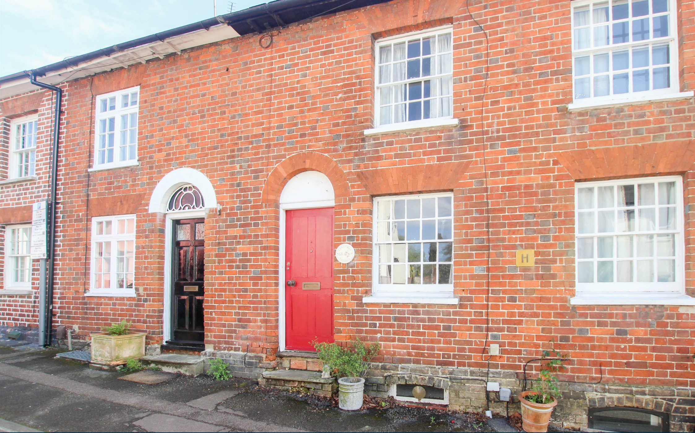
Castle Street, Saffron Walden, CB10 1BJ